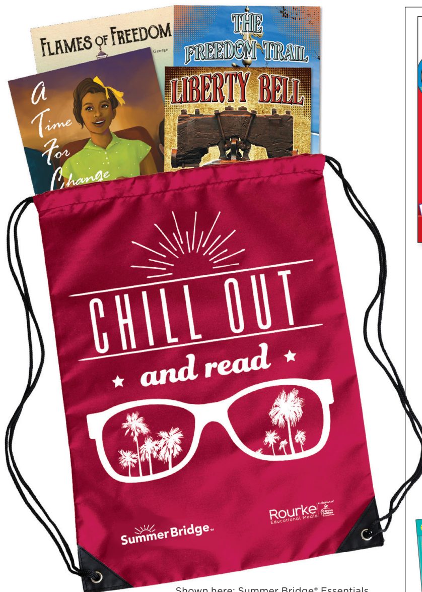
Shown here: Summer Bridge® Essentials Backpack for grades 5-6 with contents